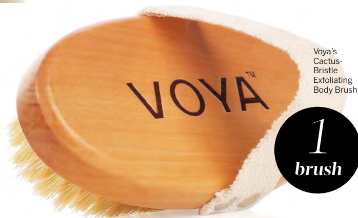
Voya's Cactus-Bristle Exfoliating Body Brush

Next, use a granular body scrub with essential oils to hydrate skin and improve texture. McKinley likes Bath Soak and Scrub by Kanya , made of Dead Sea salts, Epsom salts, shea butter and lavender oil.